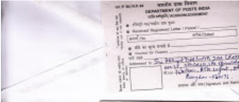
AD 2.jpg 516K